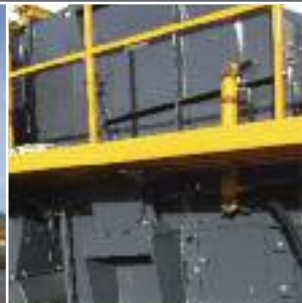
1200mm (47") Diameter Rotor