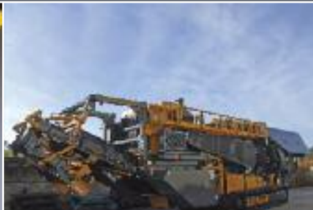
Hydraulic Folding for Transport