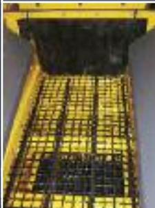
Variable meshes available